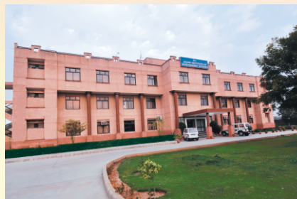
Jagan Institute of Management Studies Jaipur, Rajasthan