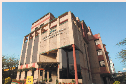
JaganNath International Management School Kalkaji, New Delhi