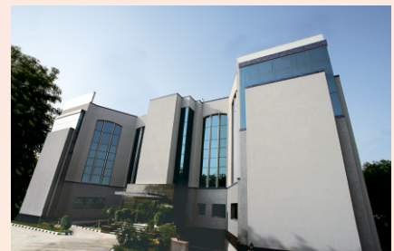
JaganNath International Management School Vasant Kunj, New Delhi