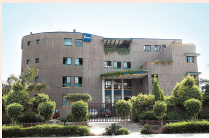
Jagan Institute of Management Studies Sector-5, Rohini, New Delhi