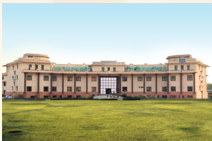
JaganNath Gupta Institute of Engineering and Technology Jaipur, Rajasthan