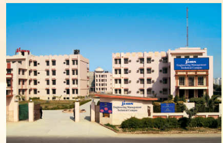
JIMS Engineering Management Technical Campus Greater Noida, U.P