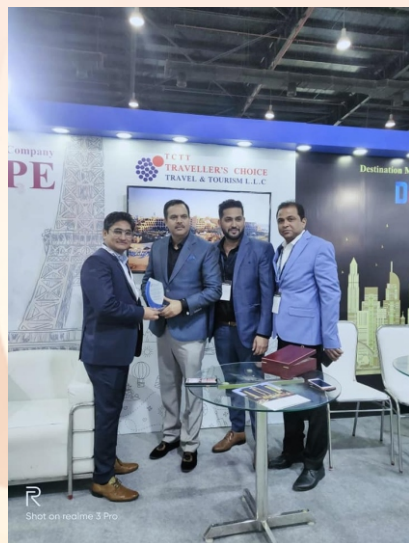
Roaming Routes Awarded by Dubai's Largest DMC for outstanding tourism